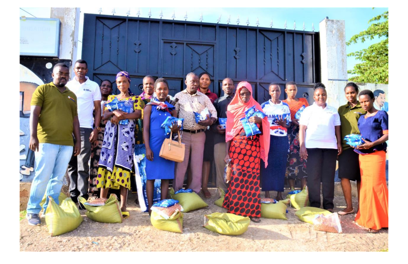
PEOPLE LIVING WITH HIV/AIDS AND REPRESENTATIVE STAFF FROM BOART LONGYEAR AND FADHILI TEEEN IN ONE PHOTO.