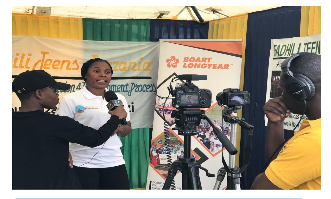
MEDIA COVARAGE, HERE FADHILI TEENS STAFF GIVE NARRATION TO MEDIA PEOPLE DURING THE COMMEMORATION DAY OF HIV/AIDS