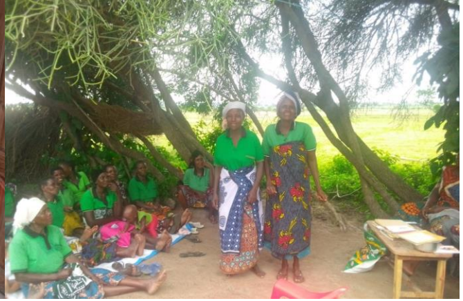
One of the group visited