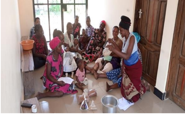
Parent in the learning on how to prepare nutrition flour