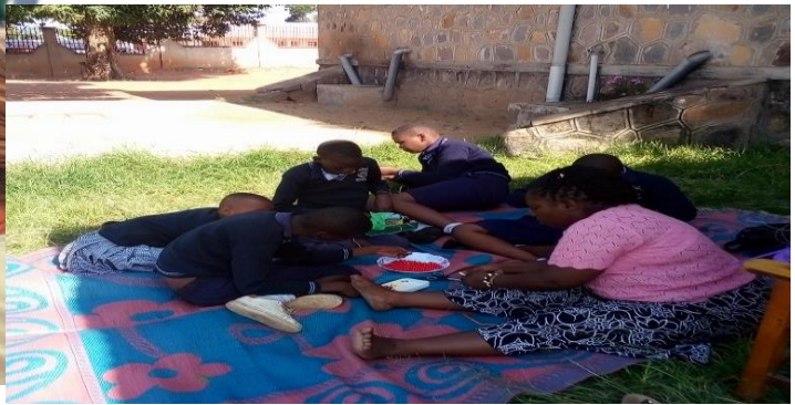
Figure 1 AND 2 caption