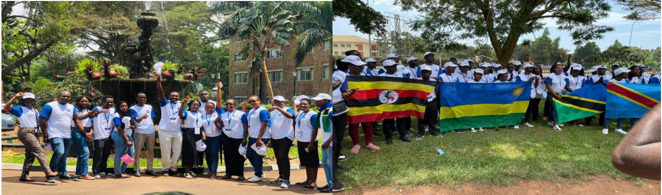
Youth from Tanzania and from other countries participating the 2022 Summer school in Uganda

The great lakes regions youth network for dialogue and peace have been a great hub that give youth space to discuss and share what they think can be useful in support youth voice and participation on different decision-making position include maintenance of peace around grate lake region.